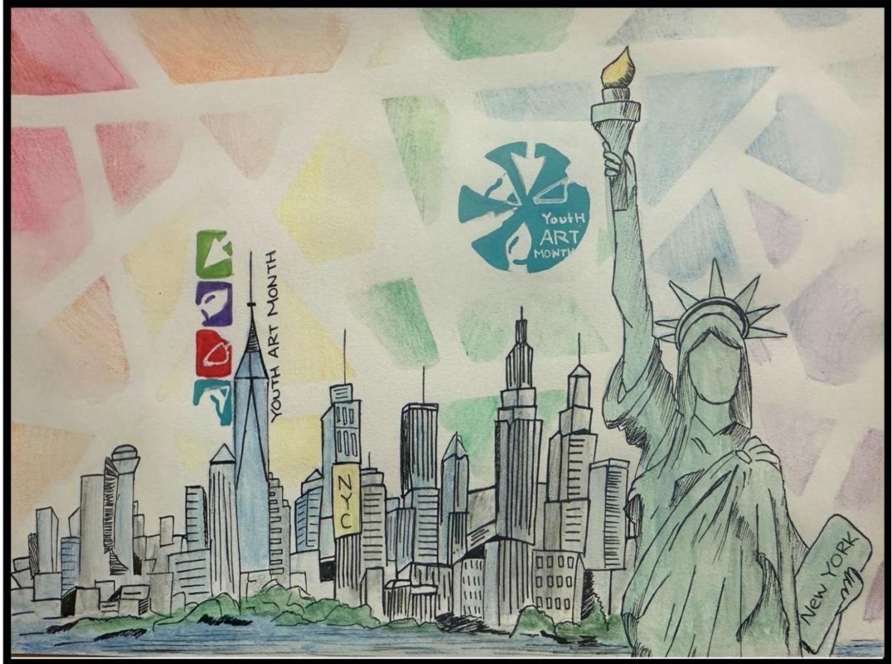
Chloe Wang's winning flag design.