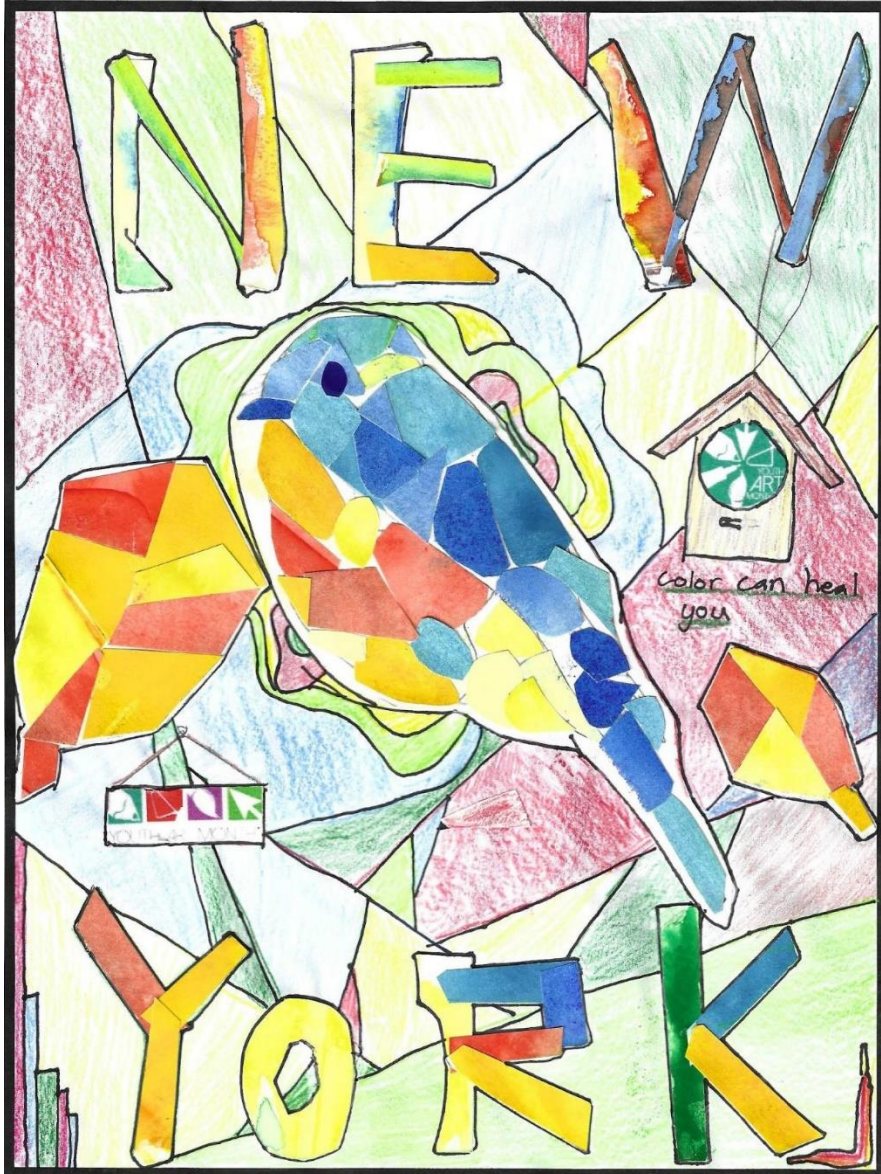
Towako Sato's winning flag design.