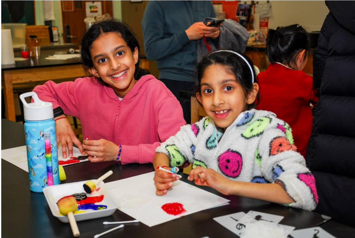
The arts were also celebrated through a variety of hands-on activities.