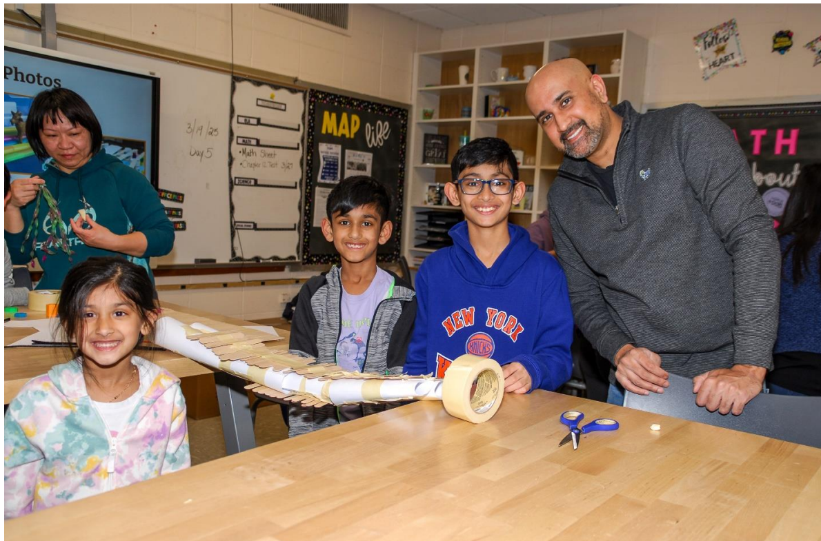
The Plainview-Old Bethpage Central School District recently celebrated its annual STEAM Night event.

For more information about the Plainview-Old Bethpage Central School District, please visit the District's website at www.pobschools.org . Exciting activities happening throughout the District and programs celebrating student achievement can also be found on the District's Facebook page at https://www.facebook.com/pobschools/ .