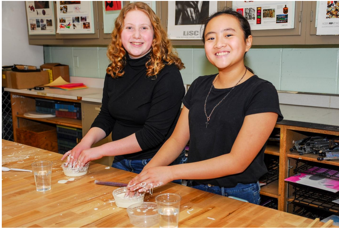
Activities included non-Newtonian "goo" experiments.