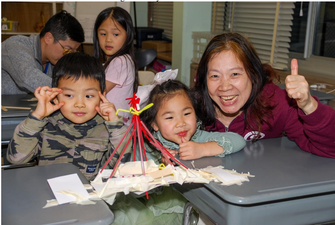
The event drew hundreds of families and children of all ages.