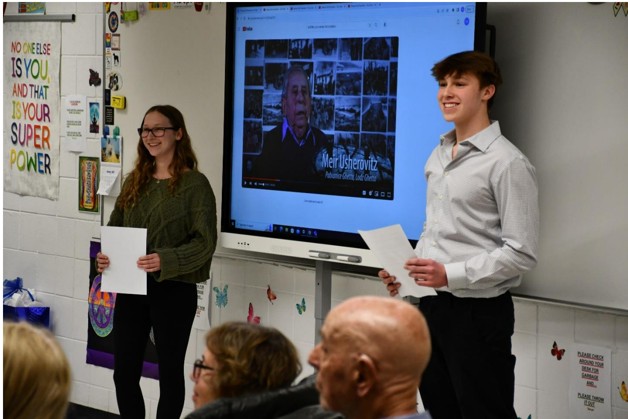
JFKHS student documentarians and recently certified 3G students presented their work on the documentary, "Names Not Numbers".