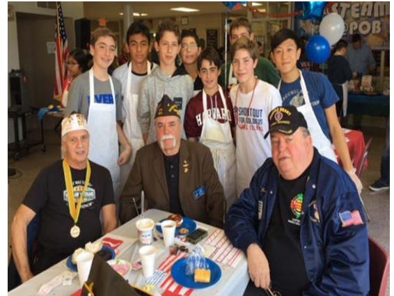
November 10, 2016

Americans. The smiles on students' faces was contagious, as they learned about the sacrifice and devotion made by the veterans, but also, about what their lives and experiences have taught them. The veterans of Beacon House deeply appreciated the gift cards to Stop & Shop given as a small token of appreciation.