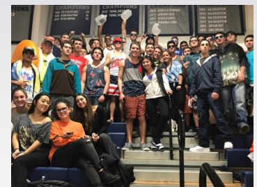
The Hawk Nest provided great support throughout the winter season. Proving once again that we have the best fans in Nassau County