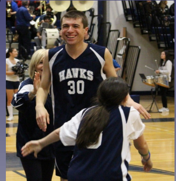
Another great season by our Challenger basketball program this year. The final game was played in front of a packed house at POB-JFK HS